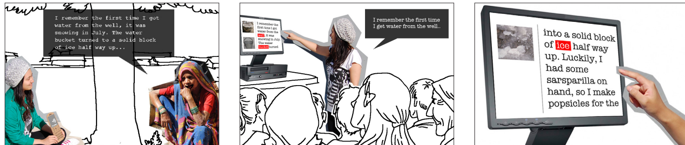
Figure 3. Family Anecdotes. Recording a story, playing it to the group, and illustrating the tale with the tagged photos.

other words with a double 'e' and then asks the players to spell those.