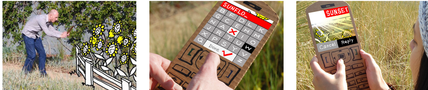
Figure 1. Tagging the Village. Capturing an image, labeling it to send, and then replying.